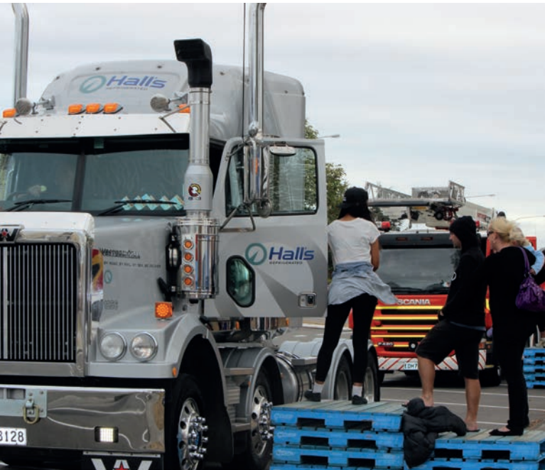
Members of the public checking out one of our Trucks