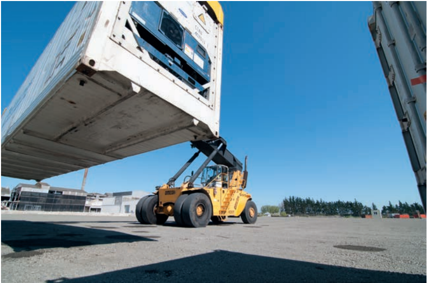
Icepak Longburn - outside