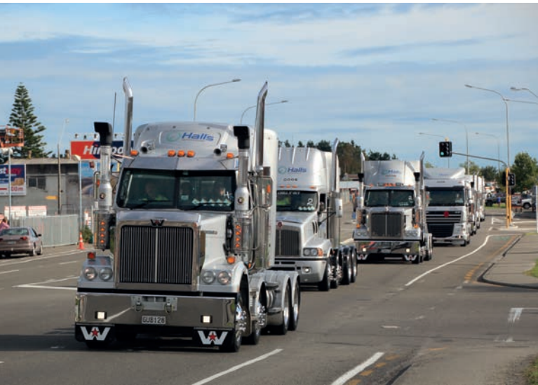
Hall's trucks driving through Palmerston North