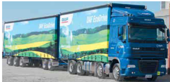
Photo Competition Winners

With the milk powder season well underway there are large volumes moving throughout the DTL network and the team is fully employed operating throughout the country. Hall's have been successful in extending our relationship with DTL and have an additional three units adding to the dedicated fleet in the early part of 2014. Watch out for the new truck photos to come.